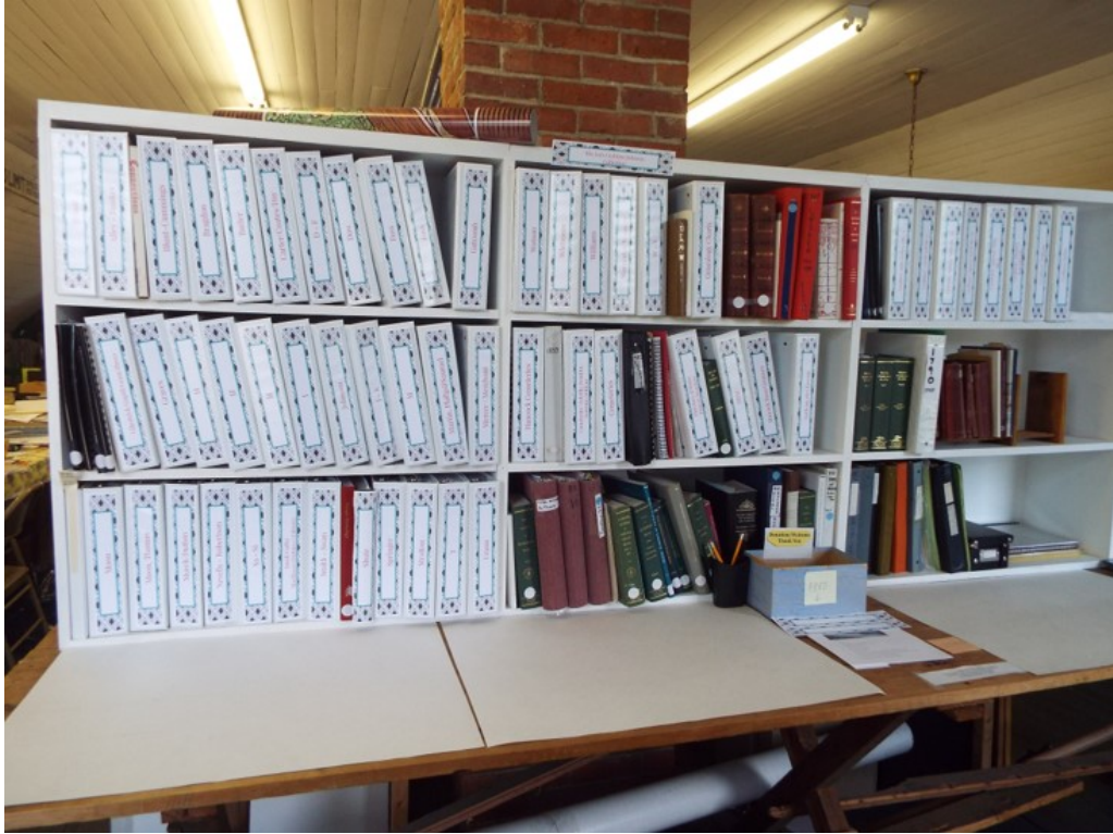
The Lois C. Johnson Historical Museum in Hancock, ME