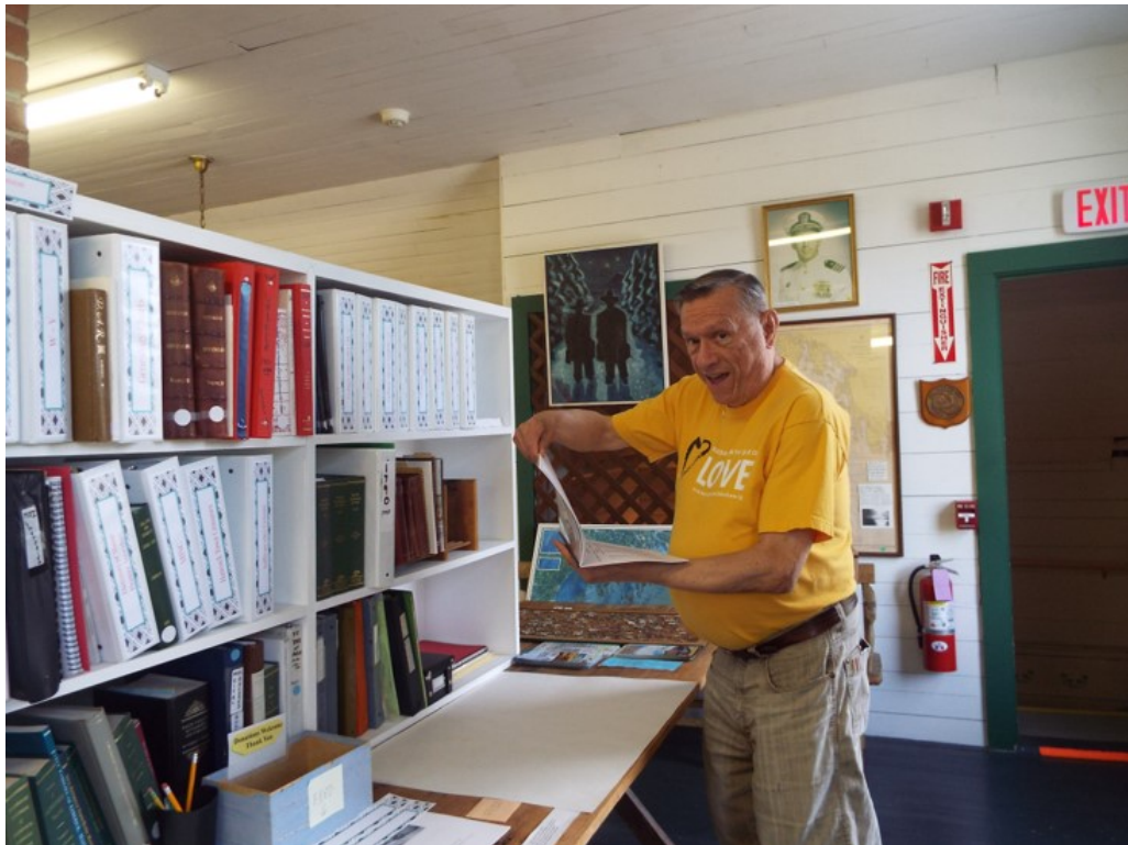
Your newsletter editor checking out a Hancock Historical Society calendar.